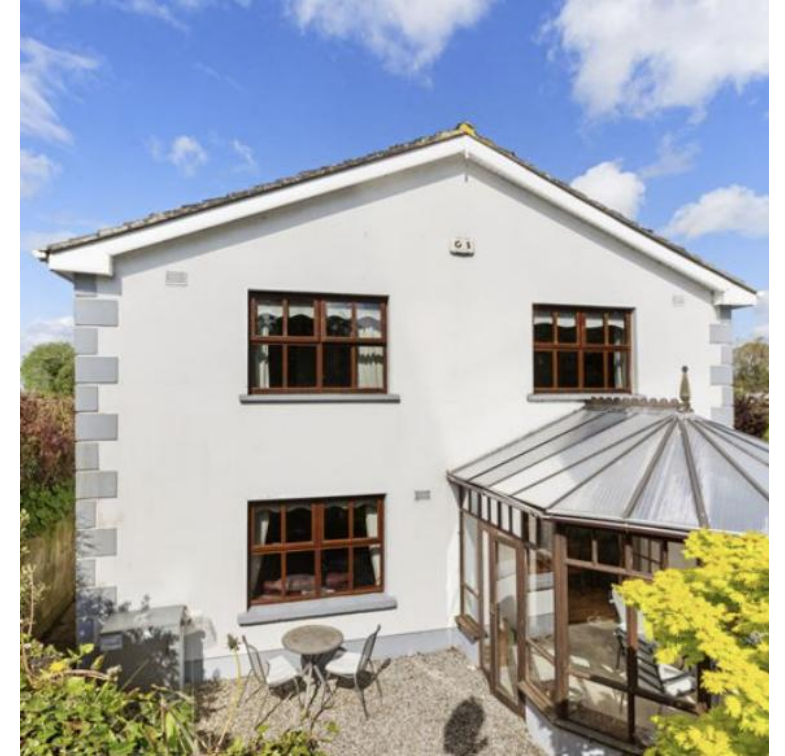
Side of house (east facing) – note the position of the conservatory, it sits towards the front of the house, not the middle