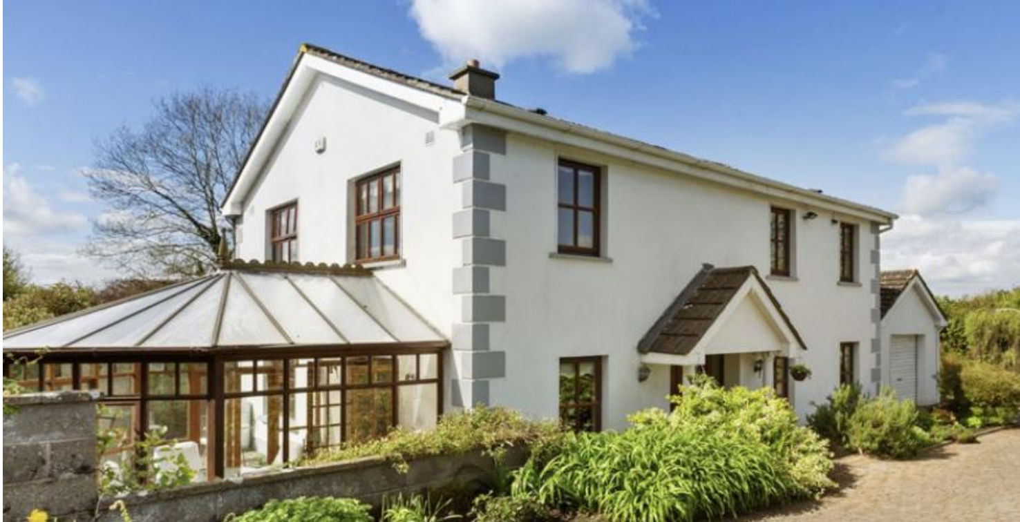
Front of house (north facing). In almost constant shade, dark, cold, damp... put rooms this side like utility, pantry, toilet etc.